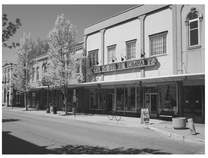
much more. KEAN'S STORE COMPANY IN DOWNTOWN MASON

Toys, Hallmark, boutique clothing, bulk candy case, housewares, & MUCH MORE!